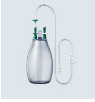
ASEPT® 1000 ml Drainage Kit L (especially drainage of ascites)