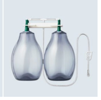
ASEPT® 3000 ml Drainage Kit L (drainage of ascites)