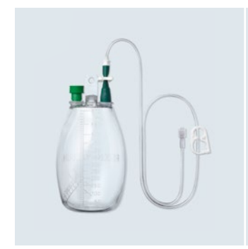
ASEPT® 600 ml Drainage Kit (especially drainage of pleural effusions)