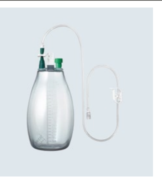
ASEPT® 1000 ml Drainage Kit (especially drainage of ascites)